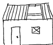
CGI partially looted or missing