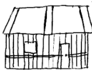
Partial reconstruction or repair with limited resources e.g. plastic sheeting, cloth, salvaged wood.