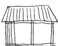
Structure safe, but walls missing or incomplete.

Definition: Minor to moderate damage, the main structure is safe - the home is repairable without demolition and reconstruction. May also apply to homes that have undergone repair already, but with insufficient materials.