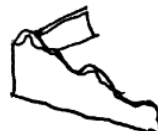
Mostly missing / only foundation