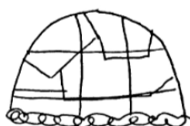
Coverage not sufficient to protect from the rain