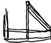
Collapsed tukul roof