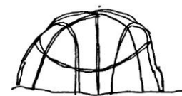
Nomadic home missing resources for coverage