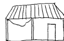
Structure safe, walls partially missing