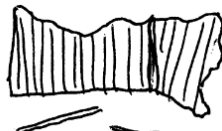
Eucalyptus / bamboo structure mostly missing