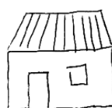
Doors and windows missing