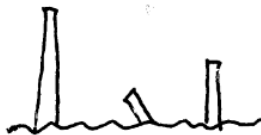
Completely burned tukul

Definition: Complete destruction, near total loss of structure, significant damage and requires demolition and reconstruction. Examples: